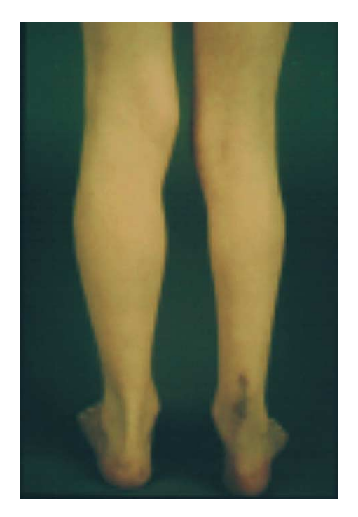
Figure 2 Chronic arterial insufficiency. Note the reduced muscle bulk in the affected right leg, which is associated with significant limb shortening. Scars reflect previous tendon releases. This child had a diagnostic cardiac catheter via the right femoral artery as a neonate.